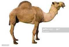
(8) This is a Camel .