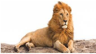
(6) This is a Lion .